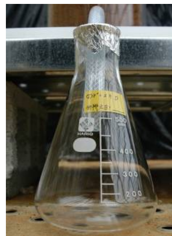
Fig. 2—The flask collecting the drainage from a column.