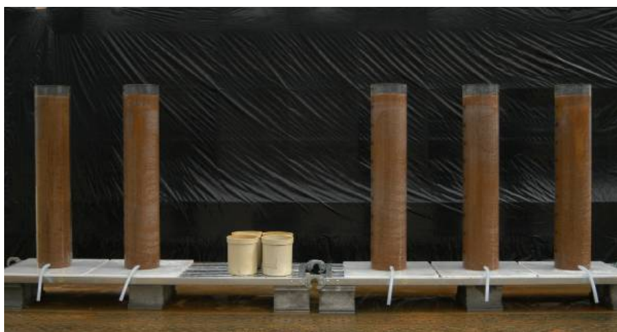
Fig. 1—The prepared columns.